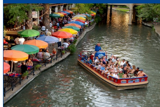
Relax on a cruise at the famous River Walk