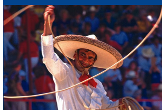
Enjoy the sights and sounds of San Antonio