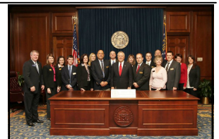
2011 Robins Regional Leadership Class Photographed at the GA State Capitol with Governor Nathan Deal