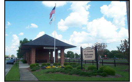
E.L. Greenway Welcome Center